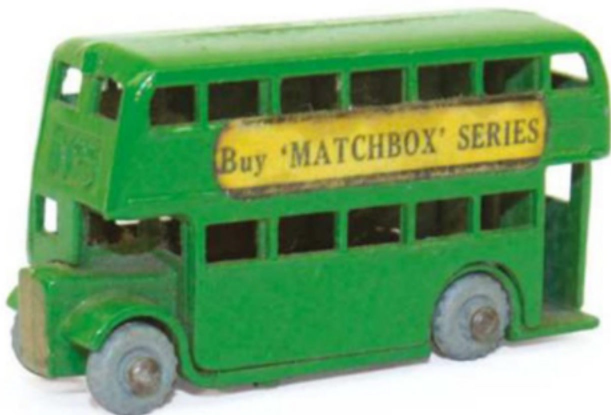
This very scarce Matchbox bus is due to go under the hammer in April: stay tuned for the result!

His most recent auction featured no small number of Lesney/Matchbox models. In the Models of